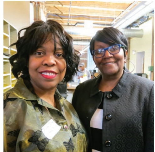
Left: Local WIOA implementation was one of many timely topics explored and discussed at CJC's Working Group.