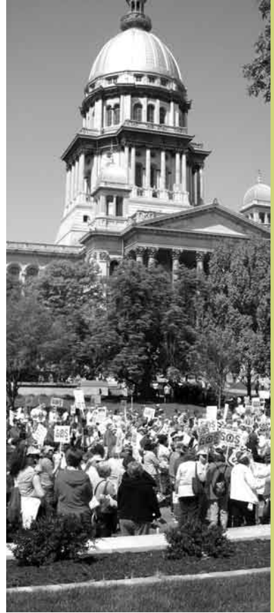
Marchers at the "Save Our State" budget rally in Springfield on April 21, 2010.

CJC engaged in two important advocacy efforts with our members and allies this year. First, IWF was an active participant in the Responsible Budget Coalition and joined with Illinois Partners for Human Services to ensure that vital services remain funded in the state budget. As part of this initiative, IWF participated in and organized call-in days, rallies at the State Capitol, and outreach to legislators to garner support to increase state revenue and prevent cuts to human services. Second, on November 6, 2009, CJC co-hosted a Statewide Leadership Conference with the West Suburban and Decatur Jobs Councils at Starved Rock State Park. Representatives from Rockford, Springfield, Decatur, Aurora, Chicago, and DuPage County attended to share best practice employment strategies for serving low-income job seekers. This conference was the first time that organizations from all five of CJC's outreach communities came together to network and share best practice information.