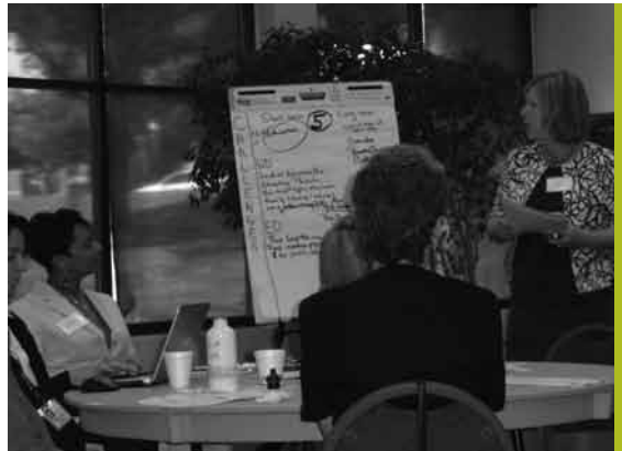
Participants at the Greater Aurora/Fox Valley Community Forum present ideas from their breakout session.

This year CJC worked with our members and partners across the state to promote the integration of workforce and economic development policy, respond to budget cuts, and increase the effectiveness of service delivery. By mobilizing individuals, organizations, and communities, we were able to advance many of our shared goals and develop innovative new workforce development strategies in the face of daunting challenges.