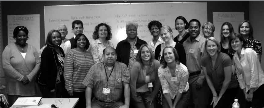
Graduates of CJC's Fall 2009 Working with Job Seekers with Criminal Records training.

further enhance their skill set. With these additions, we now offer nine courses in four distinct programmatic areas.