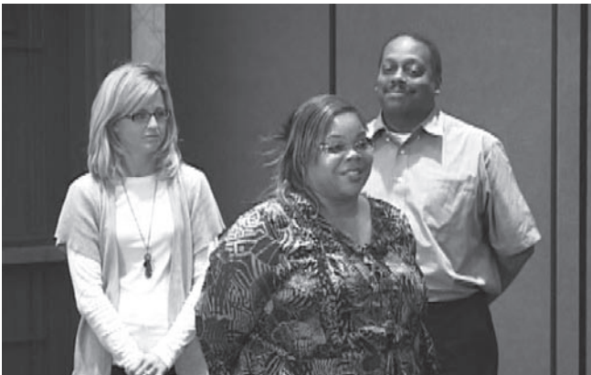
Participants from the Offender Workforce Development Specialist training.

At the core of CJC's mission is a commitment to support disadvantaged job seekers. While this description includes a wide variety of individuals, CJC focuses on three priority populations: ex-offenders, public housing residents, and youth. With the growing number of ex-offenders being released to Chicago and Illinois, many of our members have indicated their need for special training related to this population of job seekers. This year CJC revamped its multi-session training on working with job seekers with criminal backgrounds. By sending a CJC staff member to the three-week Offender Workforce Development Specialist training, we are now better able to facilitate this course and provide Illinois job developers with the most current best practices.