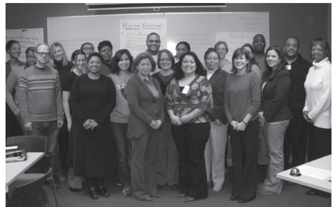
Graduates of the winter session of Working with Job Seekers with Criminal Backgrounds.