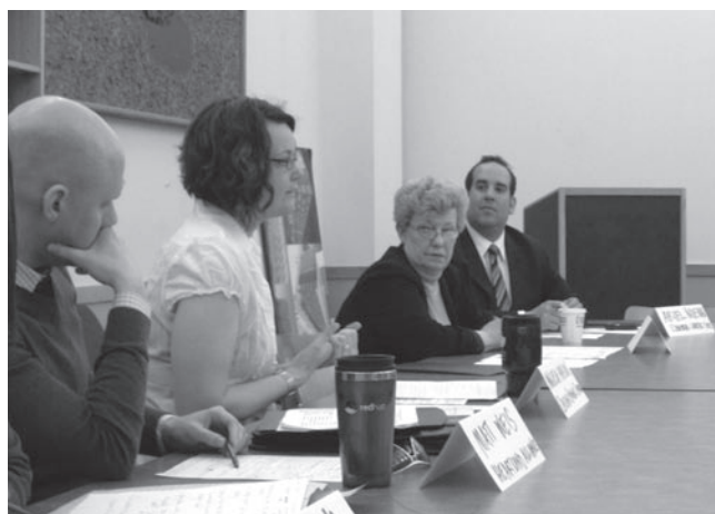
Presenters at one of the monthly working group meetings.

information and data in Chicago and Illinois. This virtual resource center, known as the Workforce Information and Resource Exchange (WIRE), will ultimately centralize important information about workforce development and closely related fields and make it accessible to providers, advocates, and other community stakeholders to support them in their day-to-day work.