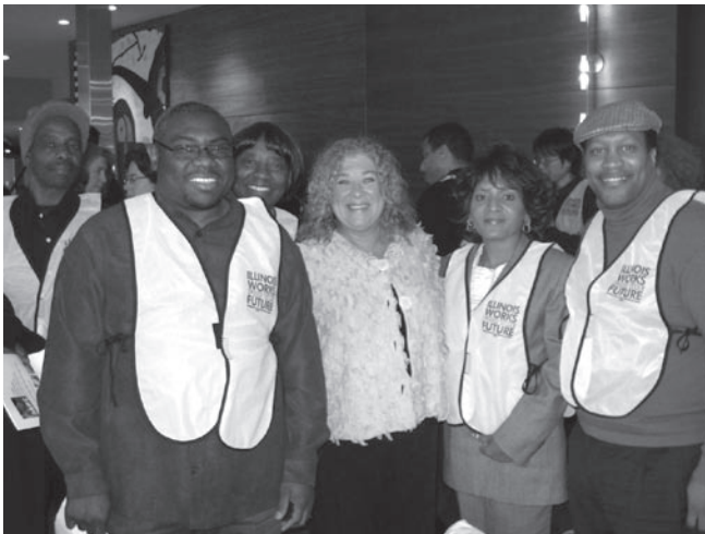
IWF supporters at the legislative advocacy day in Springfield.

Over the past year, during a time of political transition and economic downturn, the Chicago Jobs Council has successfully expanded its training and advocacy efforts to improve the employment opportunities for people living in poverty. In collaboration with our member organizations across the state, we have worked to integrate workforce and economic development through our involvement in several city level initiatives, state-wide coalitions, and capacity building efforts. By leveraging existing relationships and forging new partnerships, CJC's seat at a variety of tables has allowed us to help the city and state's workforce development professionals think strategically about the system and plan for the future.