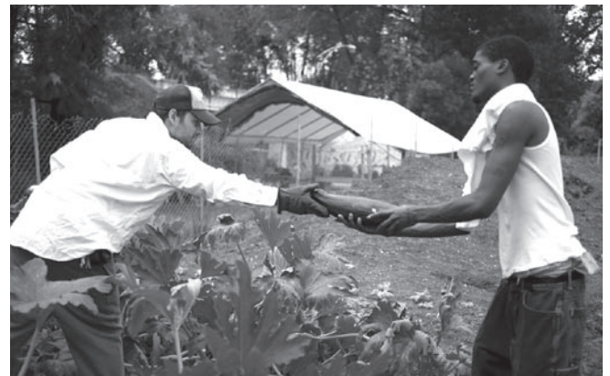
Growing Home Urban Agriculture participant harvests vegetables.

In Chicago, CJC has played an integral role in furthering the growing "green jobs" movement. In September 2008, the city released the Chicago Climate Action Plan (CCAP) detailing its efforts to make Chicago the greenest city in the nation. As part of this endeavor, CJC was asked to convene Chicago Green Jobs for All, an initiative that works to ensure Chicago residents are prepared for the jobs that are either created by or transformed through the CCAP and that the opportunities created by the CCAP are available to all Chicagoans and connected to communities in need. Beyond CJC's commitment to the green movement at a city level, we also co-sponsored a "Green Economy Forum" in Springfield where Lincoln Land Community College launched their Green Center—a resource for the local community on green economy information.