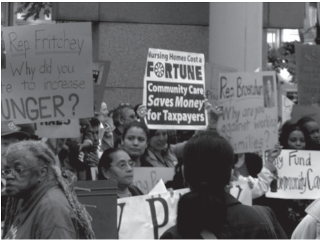
Advocates protesting the proposed state budget cuts at a rally in Daley Plaza.

instrumental in encouraging the state legislature to adopt measures to integrate workforce and economic development. With over 100 endorsers, this campaign has galvanized stakeholders from across the state.