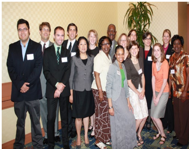
CJC Staff at 2010 Annual Meeting